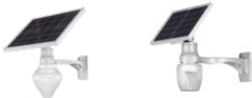
Solar Garden Light