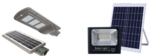
Solar Integrated Light