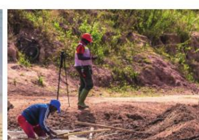
Exploration Equipment Power Supply