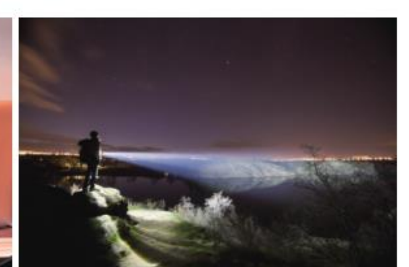
Lighting and Emergency Rescue Lighting