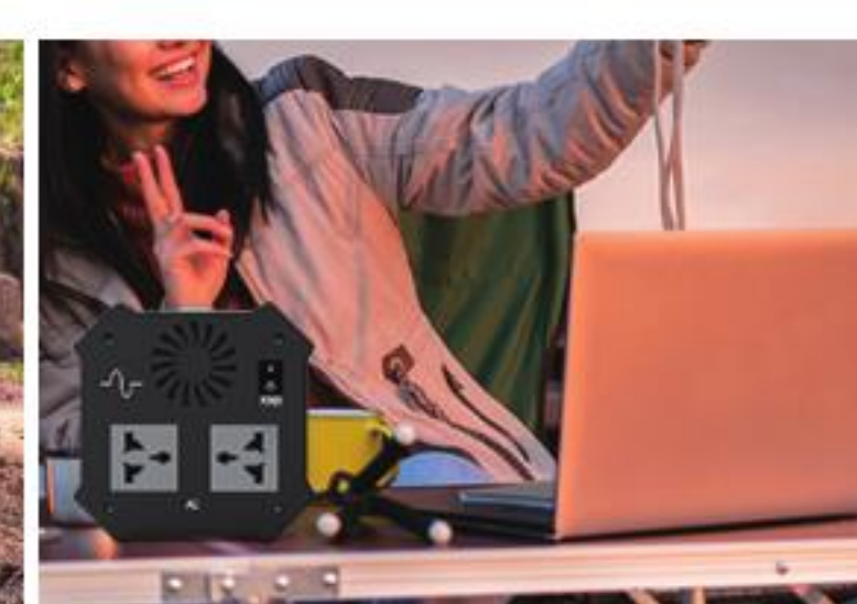
Power supply for office equipment