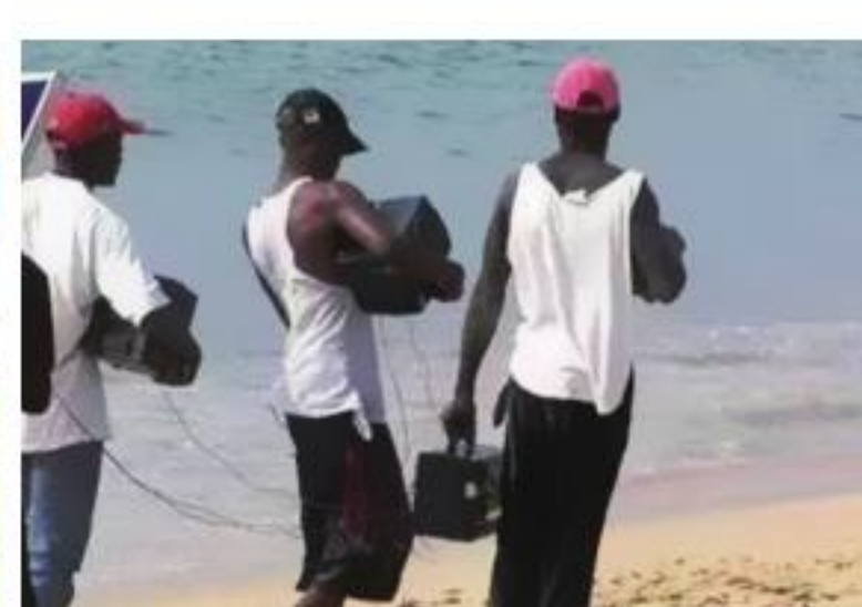
Outdoor Music Party